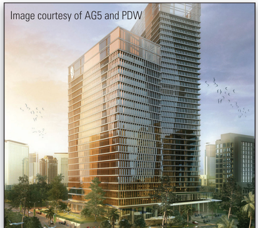
The Gran Rubina, an office building in Jakarta, Indonesia, focuses heavily on sustainable design solutions, particularly social sustainability and low energy usage